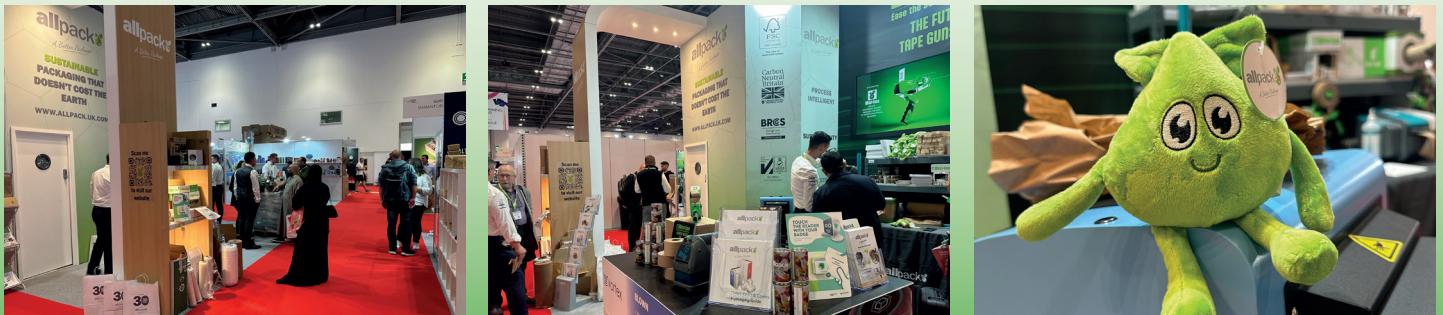
Photos of the Allpack Exhibition Stand at London Packaging Week 2024

Allpack looks forward to exhibiting at the 2025 London Packaging Week event, being held 15-16 October 2025, ExCeL, London.