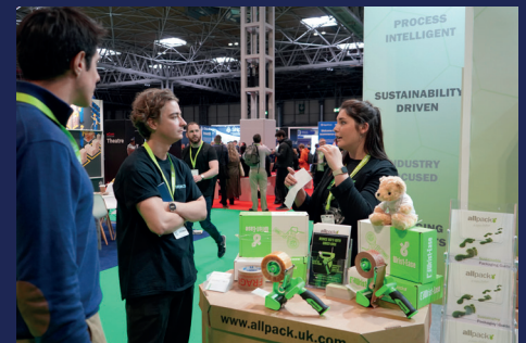
Photos of the Allpack Exhibition Stand at IRX Expo 2024